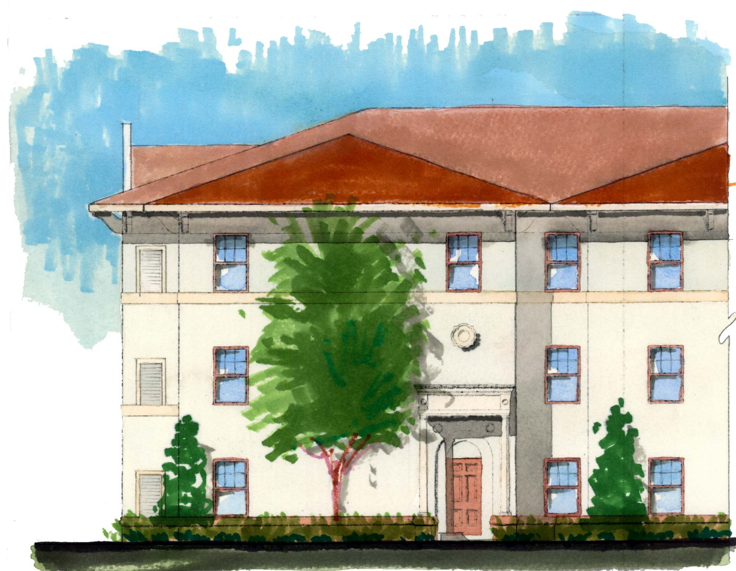
BUILDING 200 PARTIAL FRONT ELEVATION 3/16" = 1'-0"