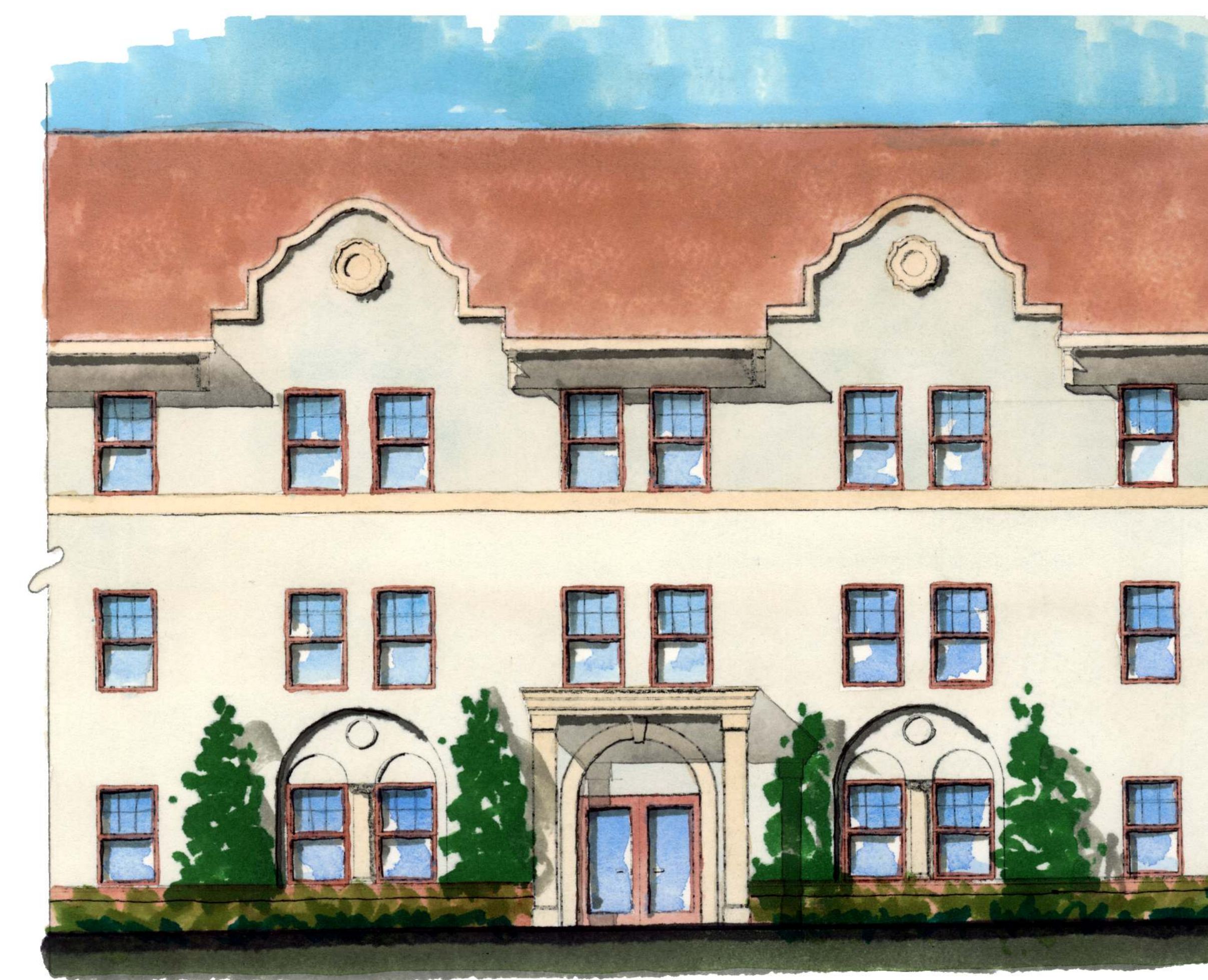
BUILDING 100 PARTIAL SIDE ELEVATION 3/16" = 1'-0"